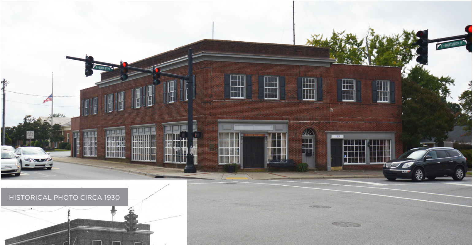
HISTORICAL PHOTO CIRCA 1930