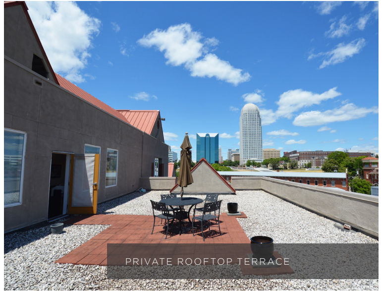
PRIVATE ROOFTOP TERRACE