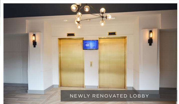
NEWLY RENOVATED LOBBY

This ±1,615 RSF Penthouse Suite offers a private rooftop terrace with incredible views of downtown Winston-Salem. Located in the recently renovated One Salem Tower, and adjacent to downtown's pedestrian stroll-way, restaurants, coffee shops, and entertainment are within walking distance. Ample free surface parking.