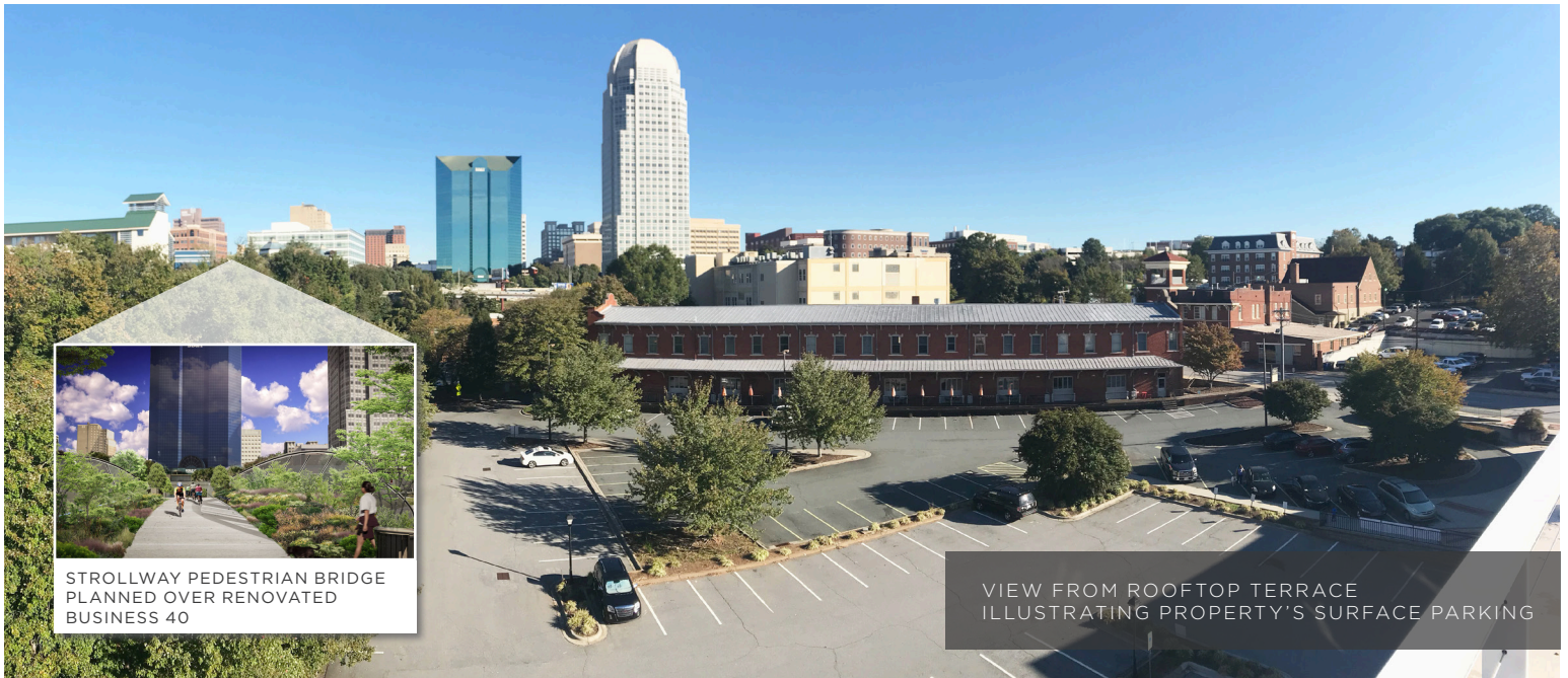
STROLLWAY PEDESTRIAN BRIDGE PLANNED OVER RENOVATED BUSINESS 40