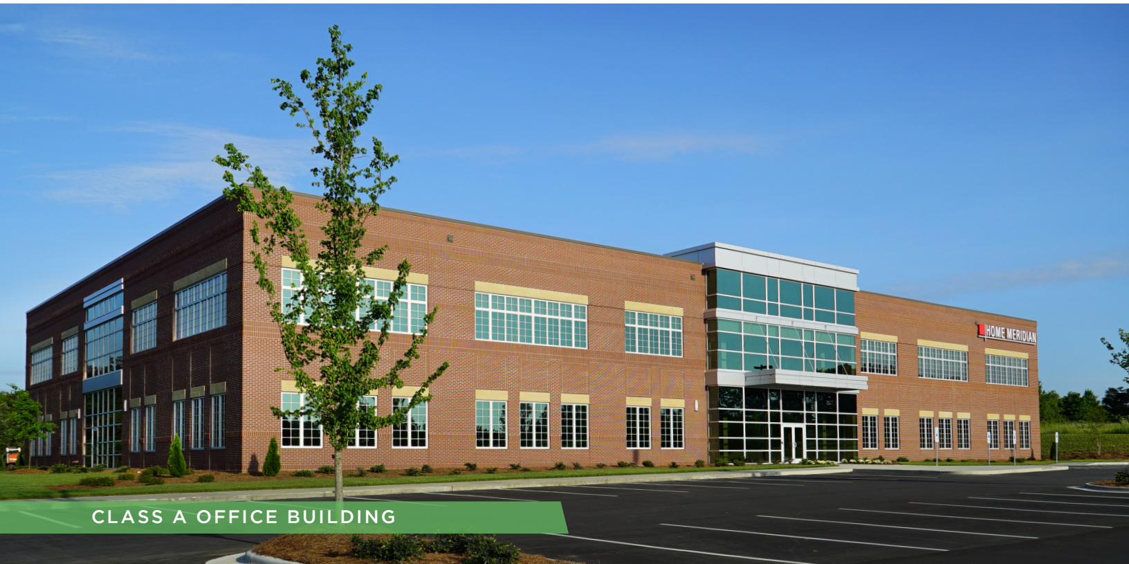
CLASS A OFFICE BUILDING