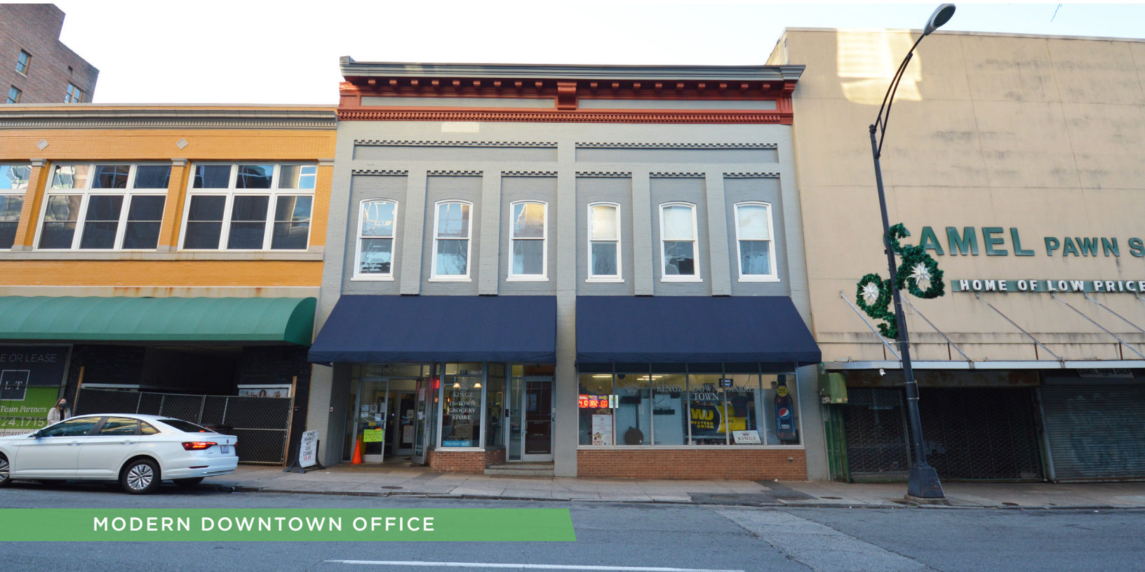
MODERN DOWNTOWN OFFICE