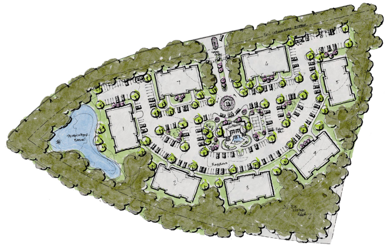
CONCEPTUAL SITE PLAN - 168 UNITS, 285 PARKING SPACES

±10.21 acres for sale on Indiana Avenue. Ideally suited for multifamily or senior housing development. Preliminary site plan - 168 units and 285 parking spaces. Conveniently located near Historic Bethabara and is easily accessible from University Parkway and directly across from the Salem Towne retirement community.