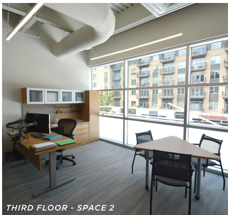
THIRD FLOOR - SPACE 2