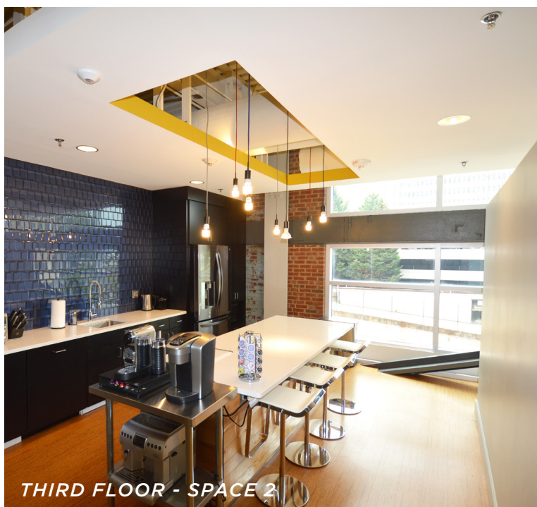
THIRD FLOOR - SPACE 2