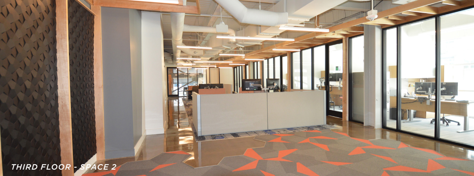
THIRD FLOOR - SPACE 2