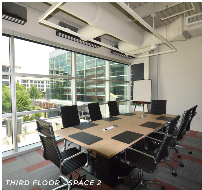
THIRD FLOOR - SPACE 2