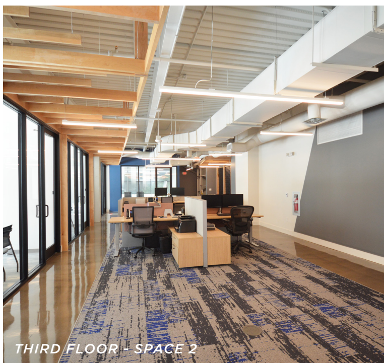
THIRD FLOOR - SPACE 2