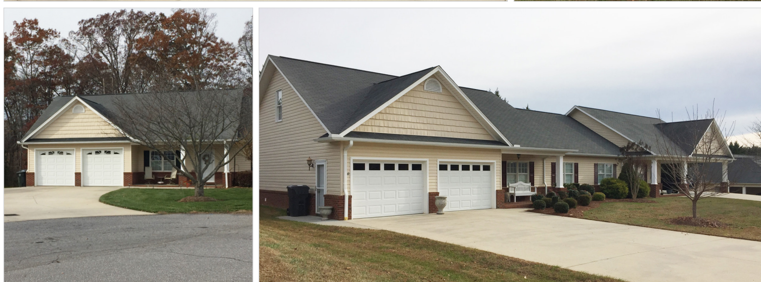
TO LEARN MORE ABOUT THIS PROPERTY, CONTACT: