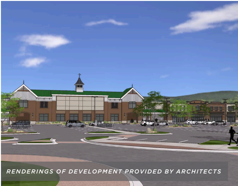
RENDERINGS OF DEVELOPMENT PROVIDED BY ARCHITECTS