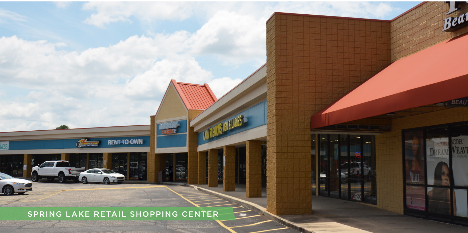
SPRING LAKE RETAIL SHOPPING CENTER