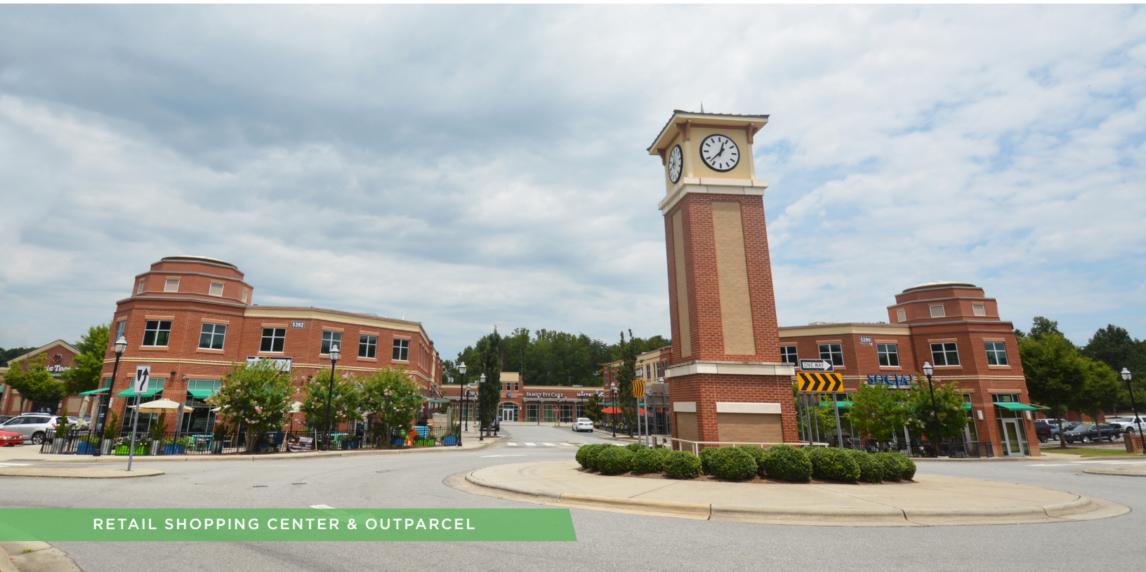
RETAIL SHOPPING CENTER & OUTPARCEL