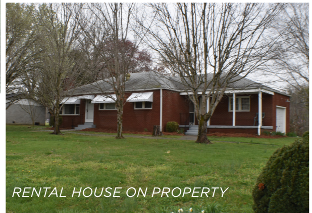
RENTAL HOUSE ON PROPERTY

Located on NC Highway 109 in Denton, NC this ±1.5 acre site is commercially zoned and offers tremendous accessibility. The subject contains a ± 1,370 SF residential house, currently rented to a tenant. Excellent expansion opportunity for a growing business.