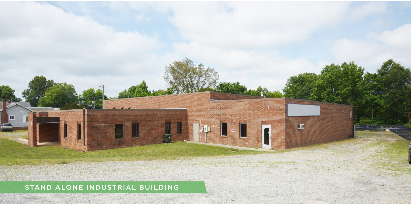
STAND ALONE INDUSTRIAL BUILDING