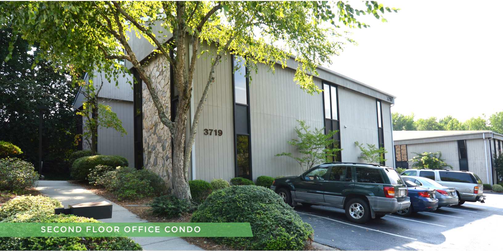
SECOND FLOOR OFFICE CONDO