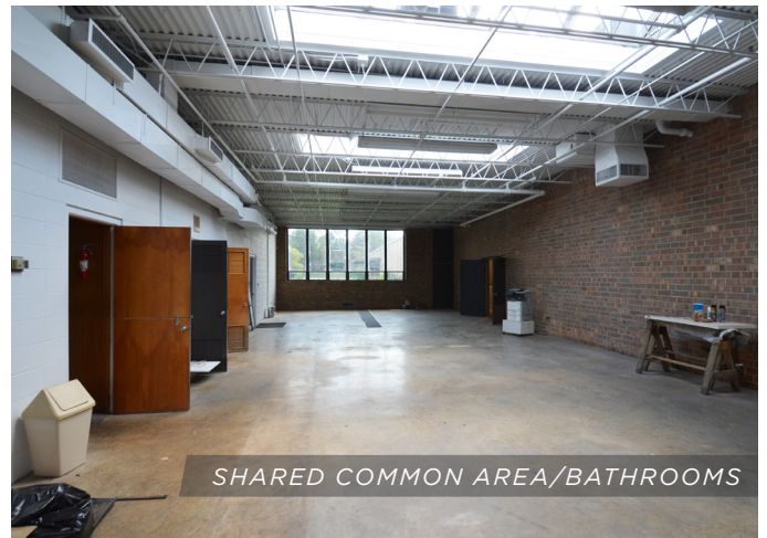
SHARED COMMON AREA/BATHROOMS