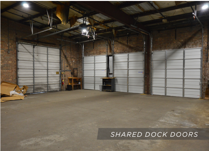
SHARED DOCK DOORS