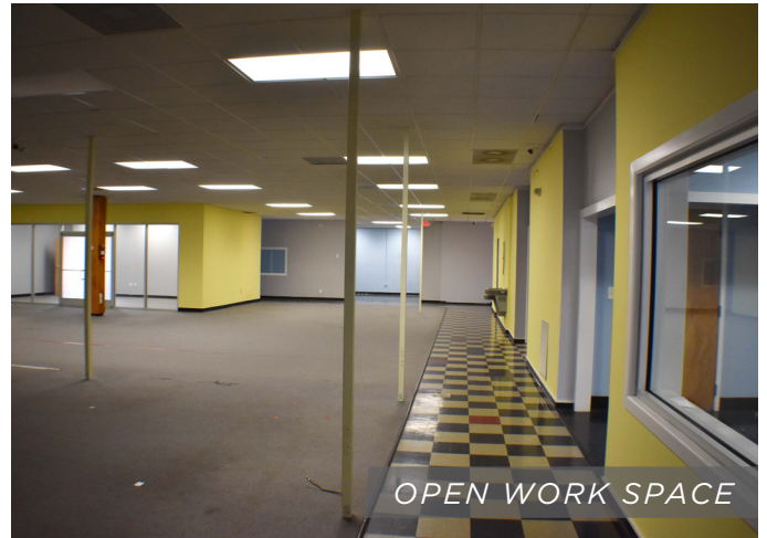
OPEN WORK SPACE