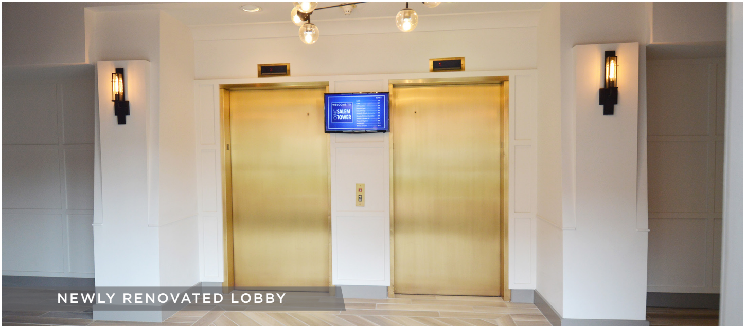
NEWLY RENOVATED LOBBY