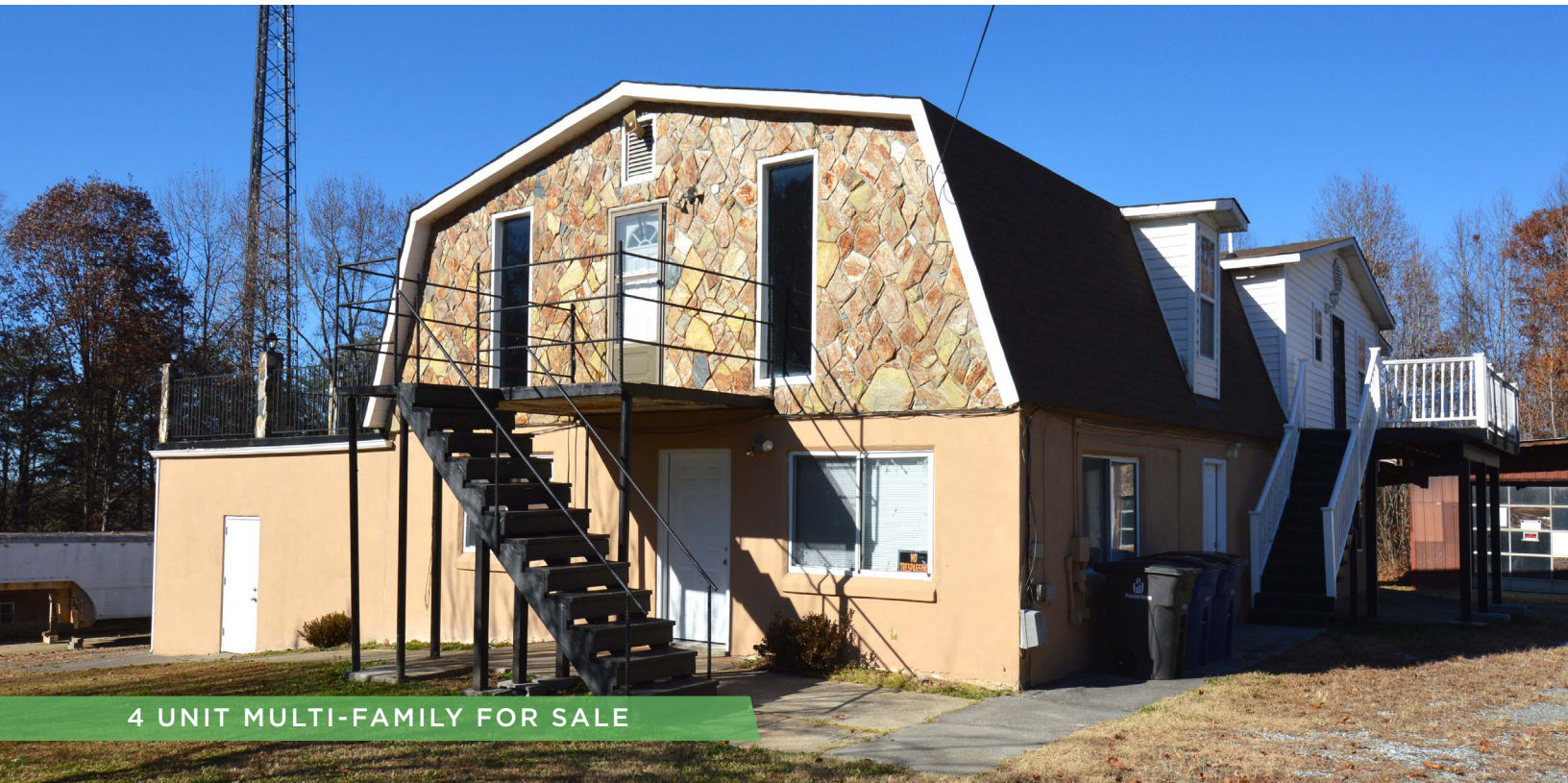
4 UNIT MULTI-FAMILY FOR SALE