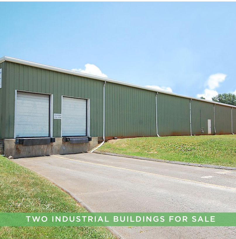
TWO INDUSTRIAL BUILDINGS FOR SALE