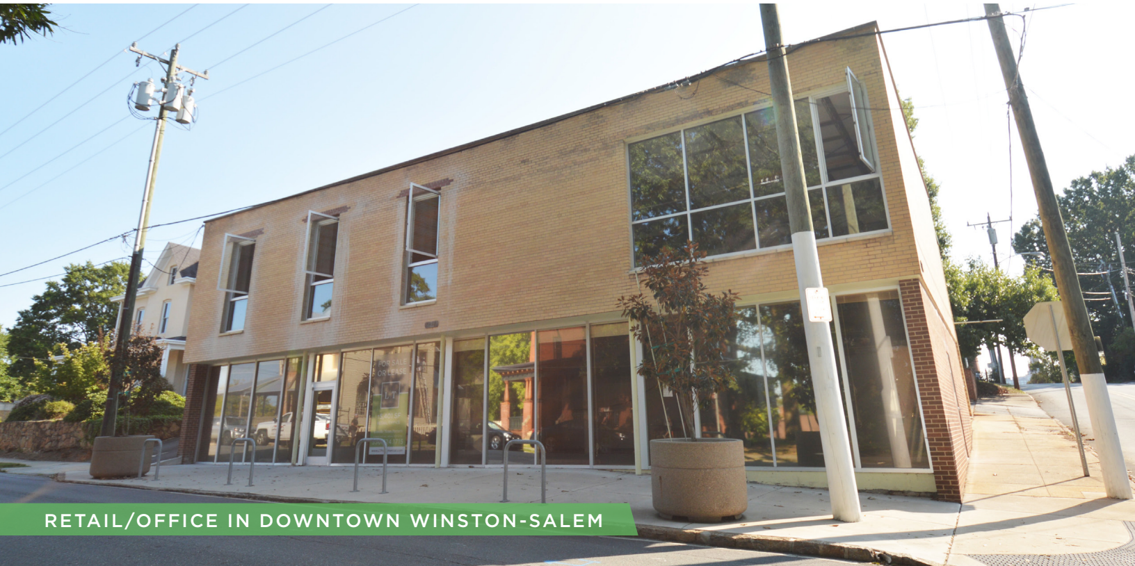
RETAIL/OFFICE IN DOWNTOWN WINSTON-SALEM