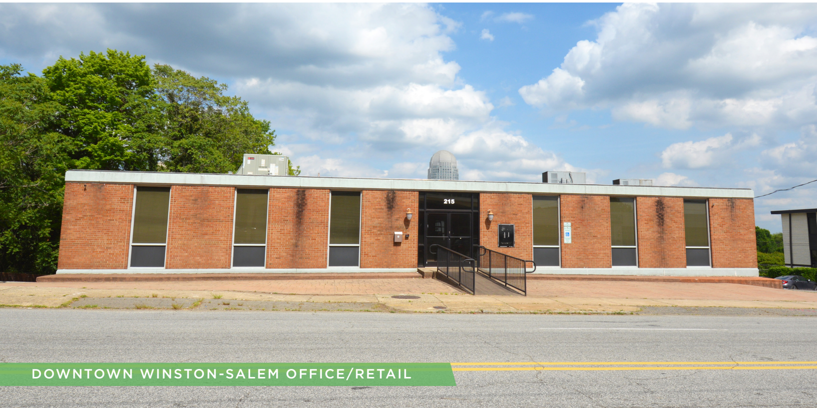
DOWNTOWN WINSTON-SALEM OFFICE/RETAIL