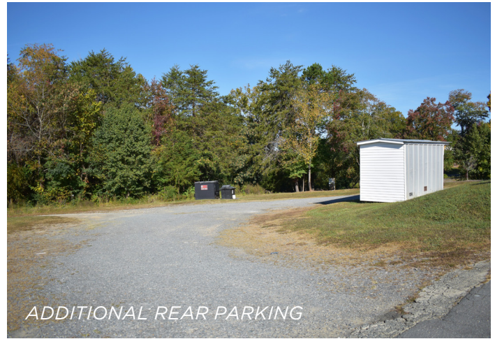
ADDITIONAL REAR PARKING