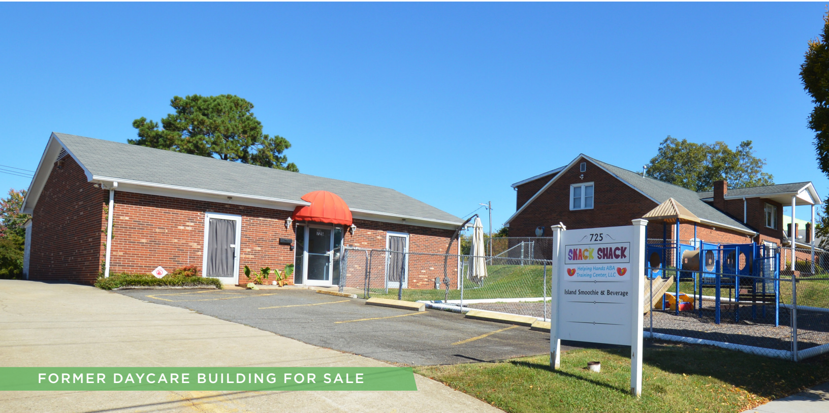
FORMER DAYCARE BUILDING FOR SALE