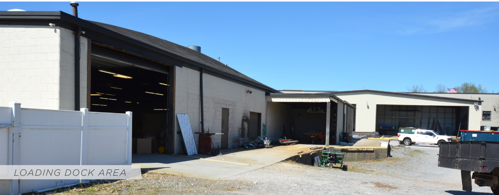
LOADING DOCK AREA