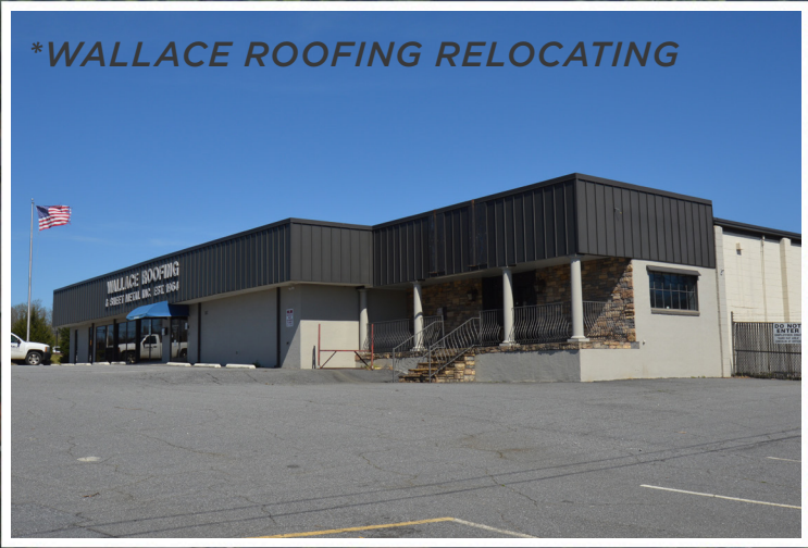
*WALLACE ROOFING RELOCATING