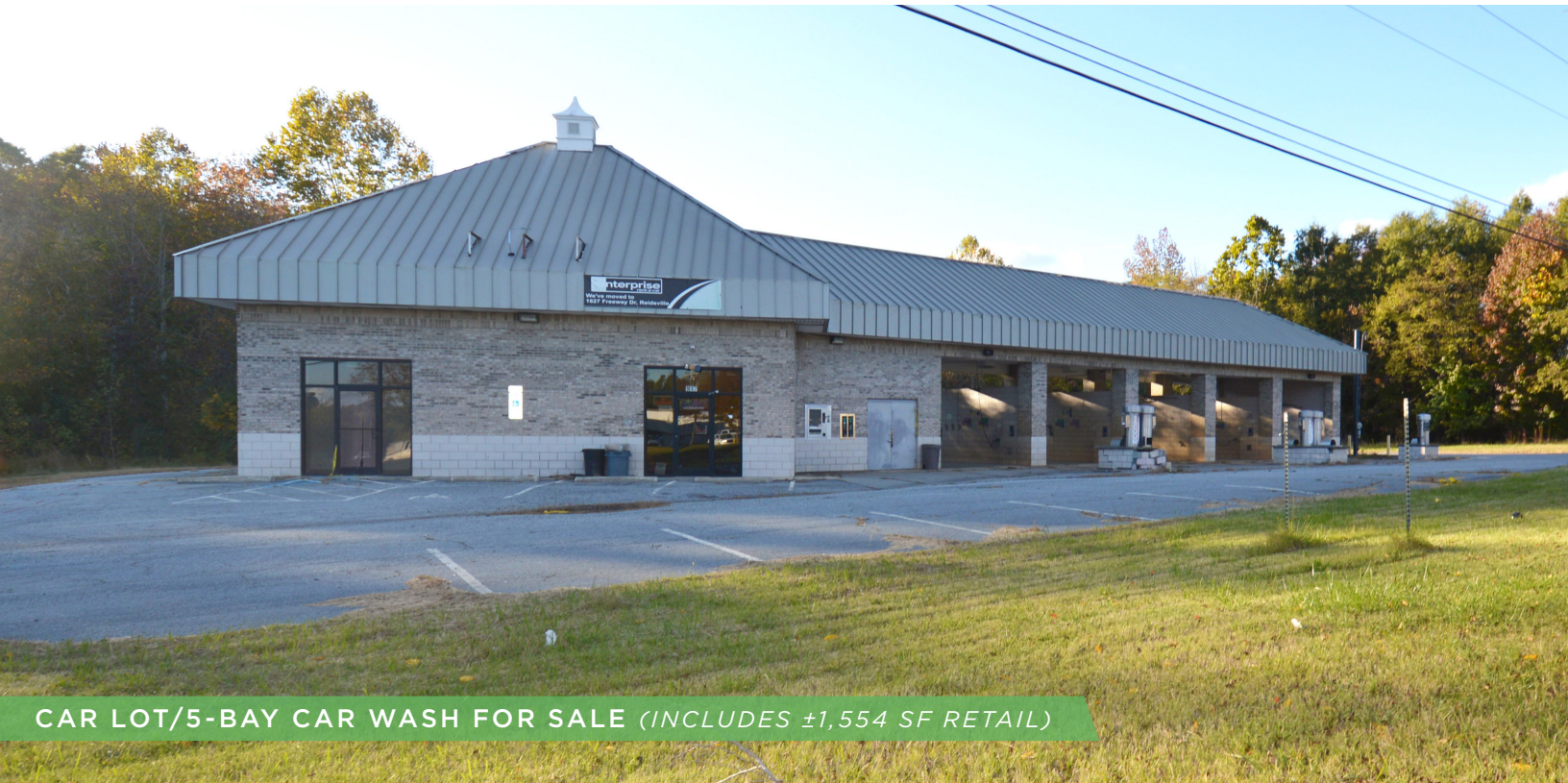
CAR LOT/5-BAY CAR WASH FOR SALE (INCLUDES ±1,554 SF RETAIL)