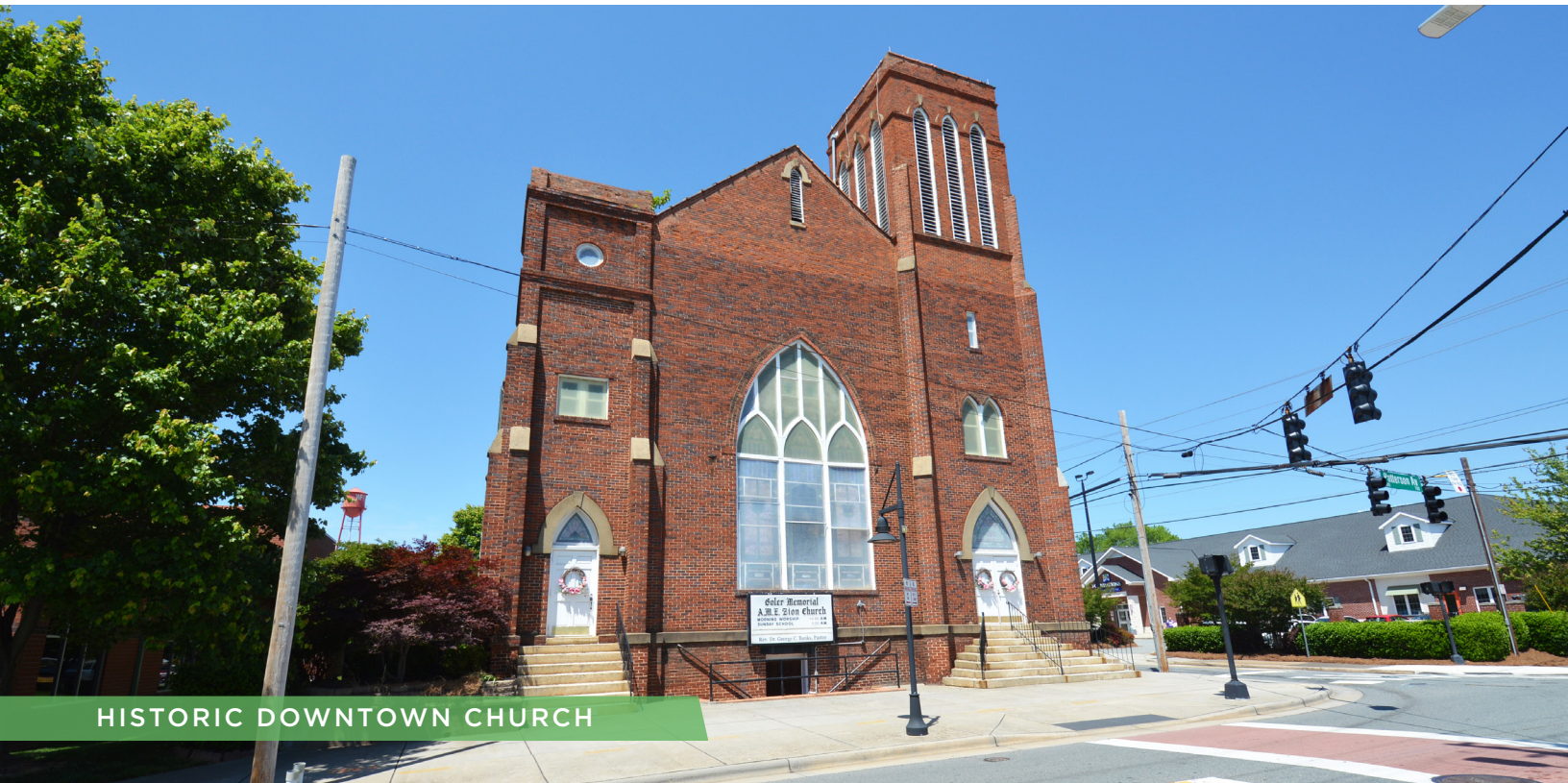
HISTORIC DOWNTOWN CHURCH