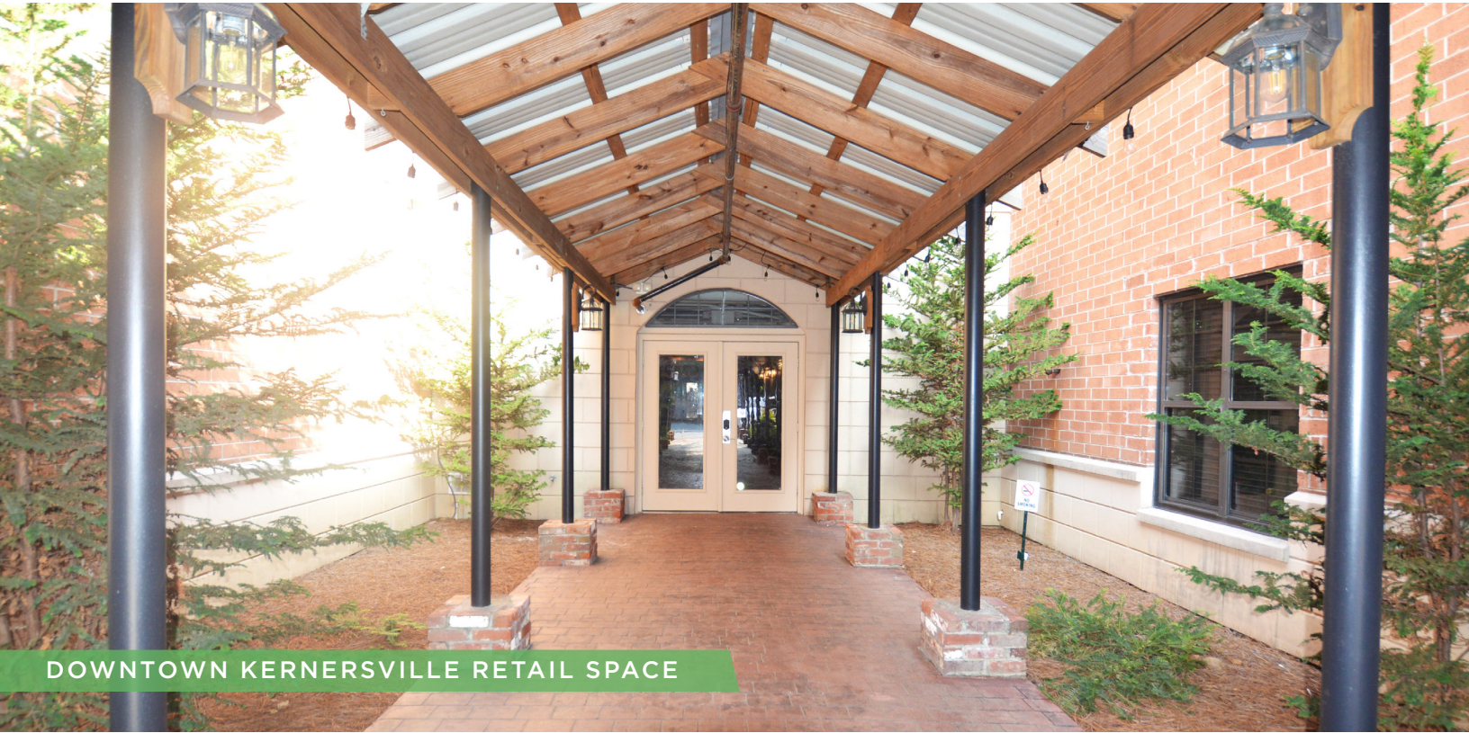
DOWNTOWN KERNERSVILLE RETAIL SPACE