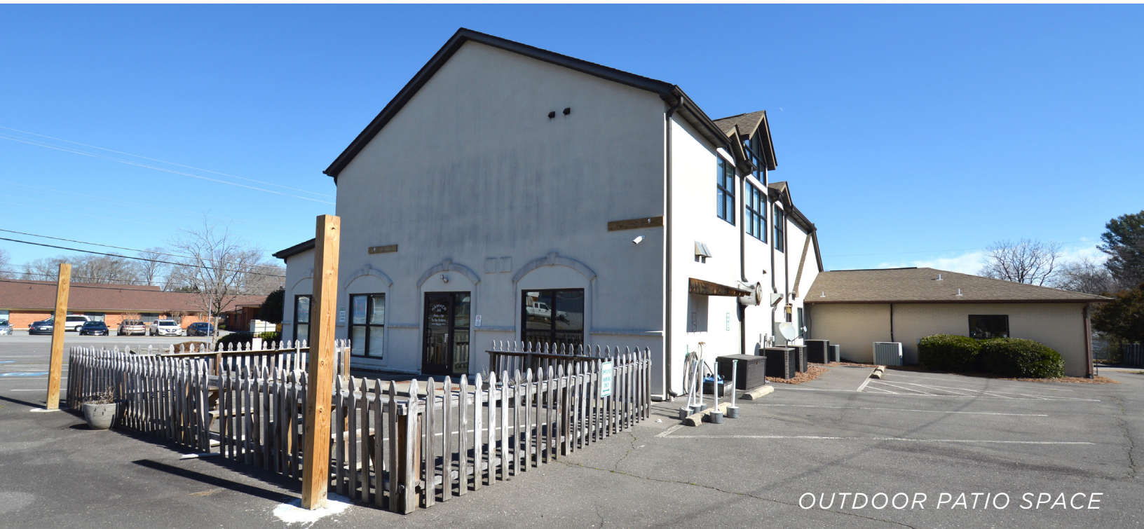
OUTDOOR PATIO SPACE