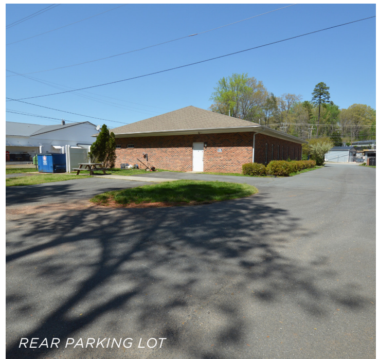
REAR PARKING LOT

Great stand-alone office building in northern Winston-Salem available! The space is ±3,000 SF and features a generously sized lobby, reception area, 6 offices, a break room, 3 restrooms, and a large open work area. The lot is fenced and there is surface parking in the front and in the rear. Perfect for traditional office users as well as many medical uses! Located near Pfafftown and about 3 miles to the future northern beltway.