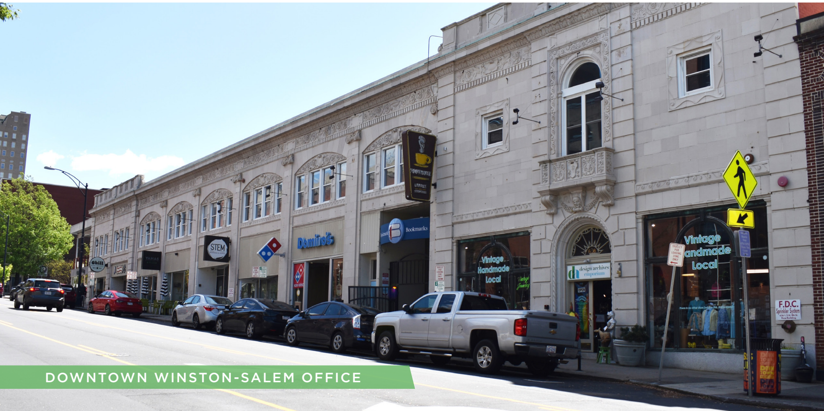
DOWNTOWN WINSTON-SALEM OFFICE