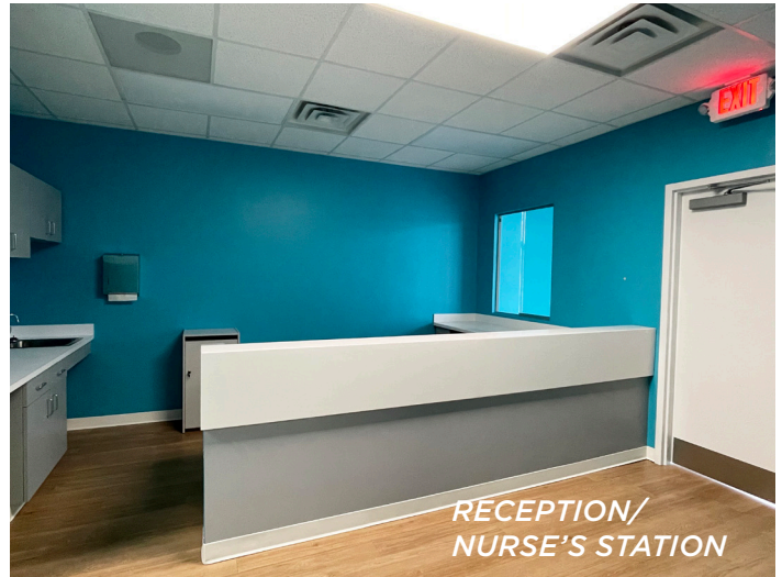
RECEPTION/ NURSE'S STATION