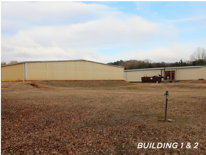
BUILDING 1 & 2