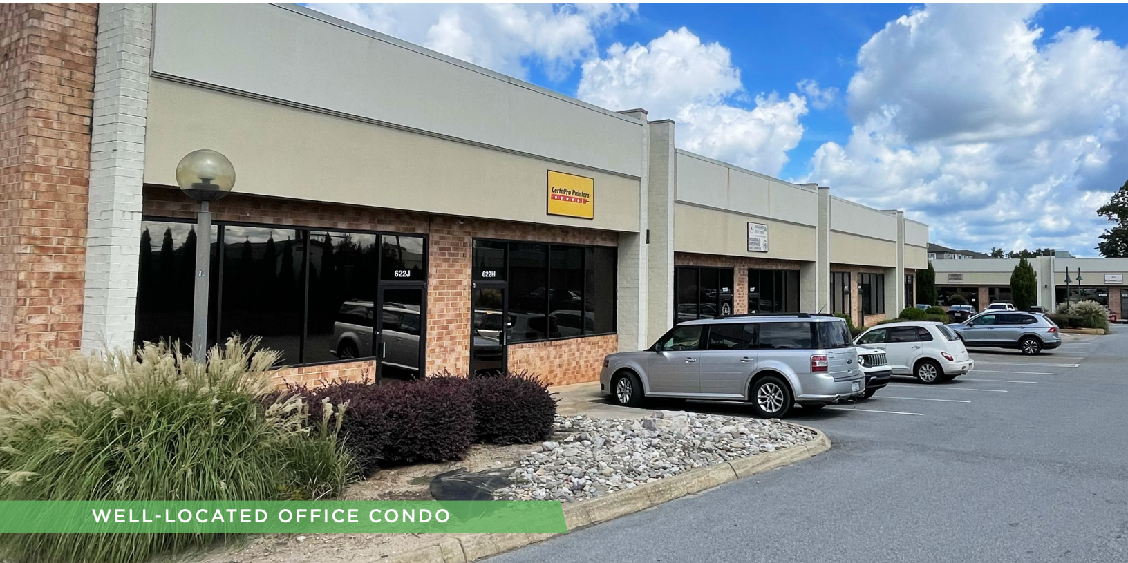
WELL-LOCATED OFFICE CONDO