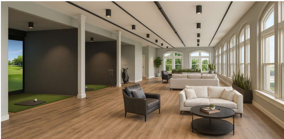
Golf Simulator Rendering